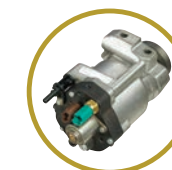
FUEL PUMP £703

And when you consider that modern vehicles contain over 1000 components, any of which might fail over time, the impact on your pocket could be painful.