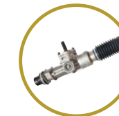
STEERING RACK £537